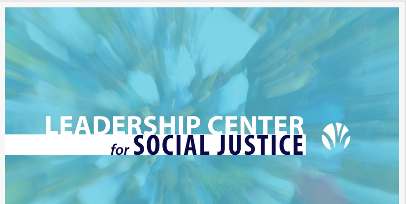
Leadership Center for Social Justice Logo

About The Leadership Center for Social Justice