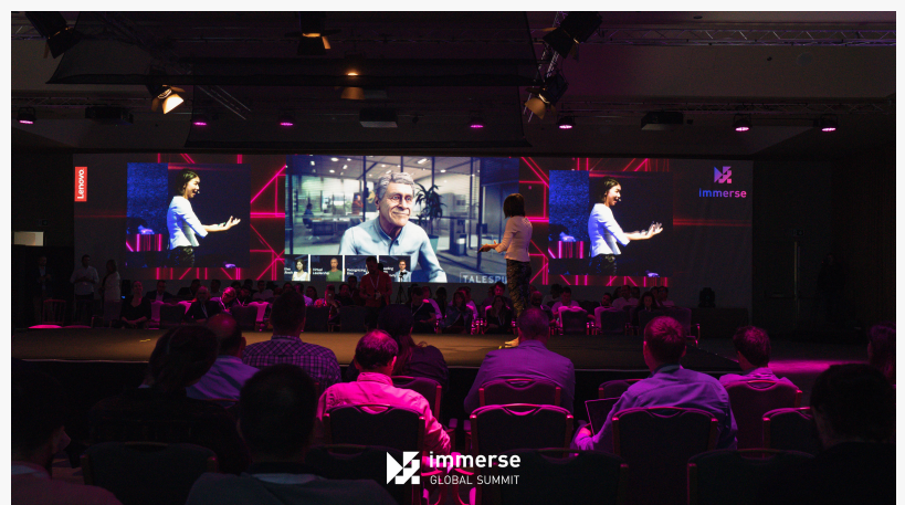
Photo from Immerse Global Summit Madeira 2022

Immerse Global Summit is expected to draw 1000+ attendees (both in-person and online/virtual)