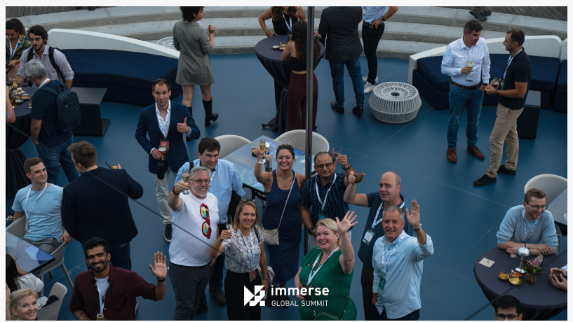
Immerse Global Summit networking session among global tech leaders

to the Fontainebleau Hotel, the venue for the conference which will feature over 200 thought-leaders in the XR, metaverse, blockchain, and connectivity ecosystem, including those from AT&T, Meta, Lenovo, Qualcomm, Magic Leap, Sony, Unity Technologies, Amazon, Boeing, General Motors, University of Miami, Agora, and emerging companies: Room, Immersal, Emteq Labs, Aequilibrium, AMPD, Leia Inc., Departure Lounge and many more.