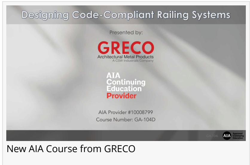
New AIA Course from GRECO

TAMPA, FL, UNITED STATES, November 18, 2022 /EINPresswire.com/ -- GRECO Architectural Metal Products (GRECO), a leading manufacturer of high-quality architectural railings and metal products for multi-family and commercial structures in the United States and Canada, is excited to announce its newest continuing education course for architects and designers.