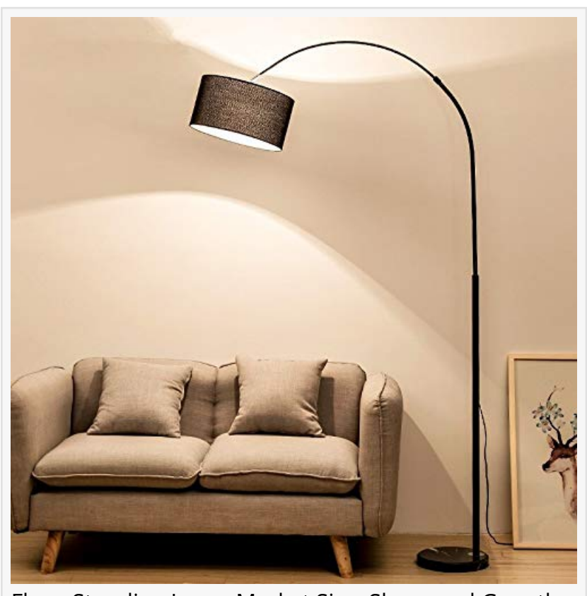
Floor-Standing Lamp Market Size, Share and Growth

You have no time to read the complete article. Then you can check out this Ortho Floor-Standing Lamp. Also, I have shared a buying guide [What Advantages should be in it] that will let you know the important things. That you should Consider in Floor-Standing Lamp Market.