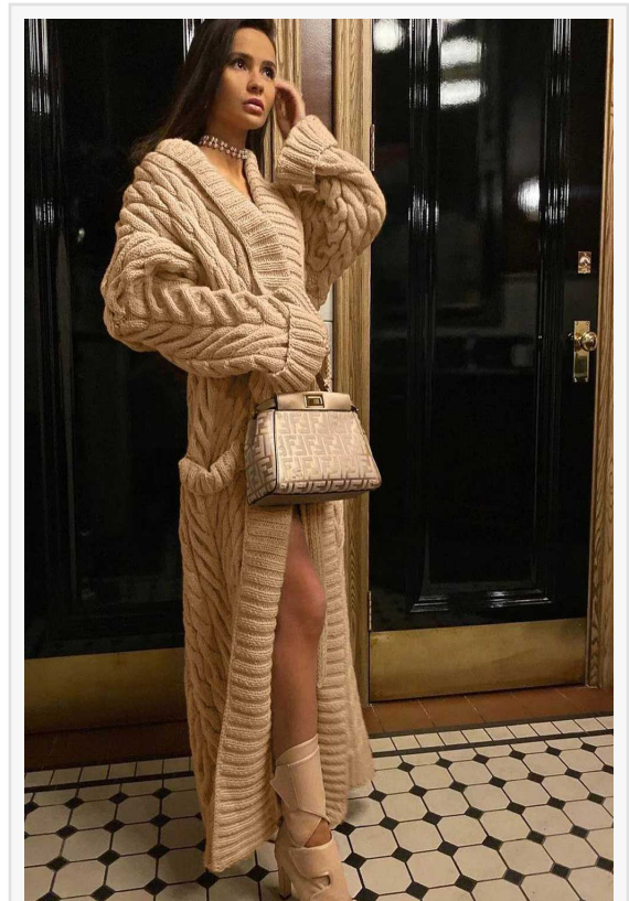
2023 Winter Trends in Women Coats DKstyle

This press release can be viewed online at: https://www.einpresswire.com/article/601836399