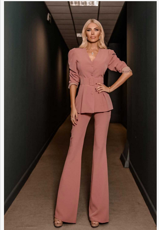
2023 Winter Trends in Women's Clothes

In 2023, corsets incorporated into tops and dresses are more likely to be seen, and lots of leather corsets, resulting in a sultry. Combine corsets with jeans and oversized cardigans if skirt combinations seem too much.