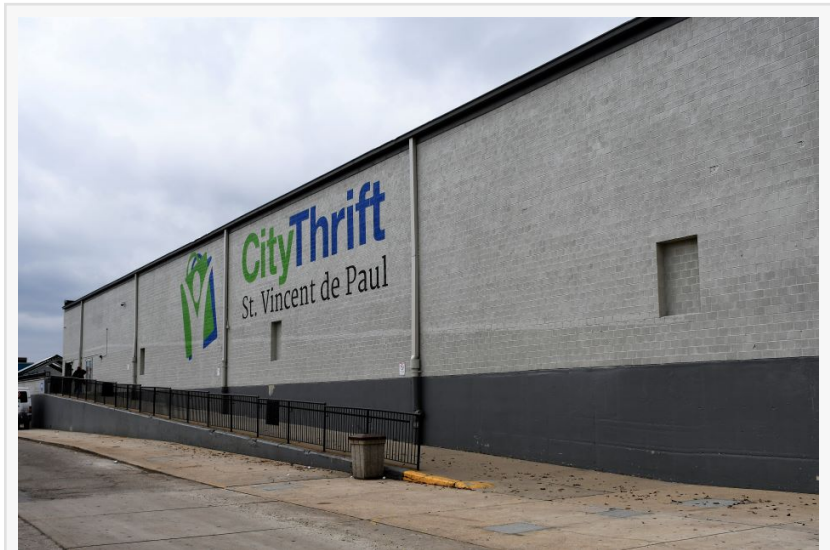
St. Vincent de Paul CityThrift Dayton

announced today the launch of new branding and other improvements at its local community thrift store, now known as CityThrift St. Vincent de Paul. With the new branding and renovation of CityThrift, located at 945 S Edwin C Moses Blvd, the organization positions the store to better serve shoppers with a clean and comfortable department store-style shopping experience.