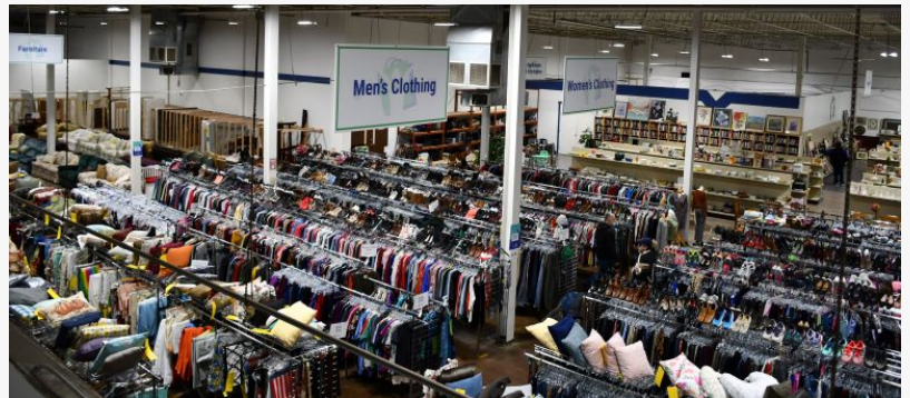
CityThrift's Large Selection

About the St. Vincent de Paul Society, Dayton District: The Society of St. Vincent de Paul, Dayton District, with Christian purpose, provides person-to-person emergency assistance and supportive services to men, women, and children in Montgomery County and surrounding communities who are on the brink of becoming homeless or who are already homeless. For more information about the organization, please visit stvincentdayton.org .