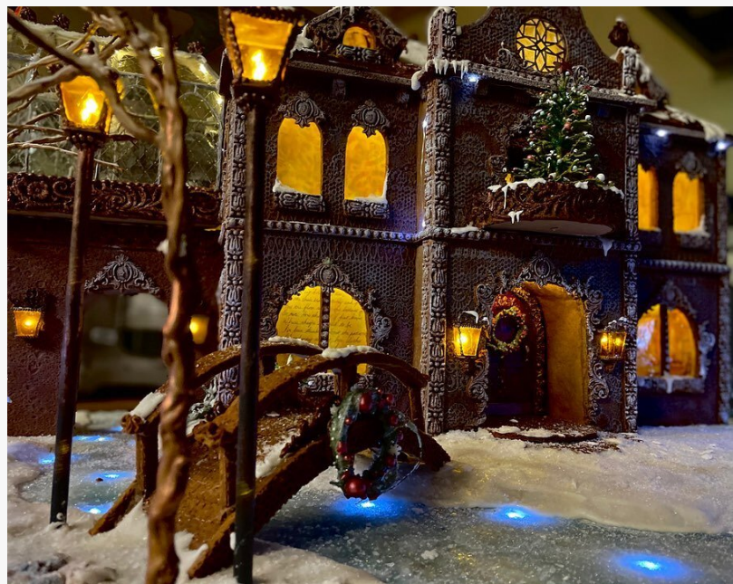
Gingerbread House Scene

This press release can be viewed online at: https://www.einpresswire.com/article/601890355