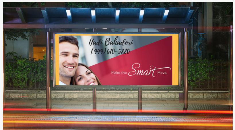
Short sale realtors in Temecula