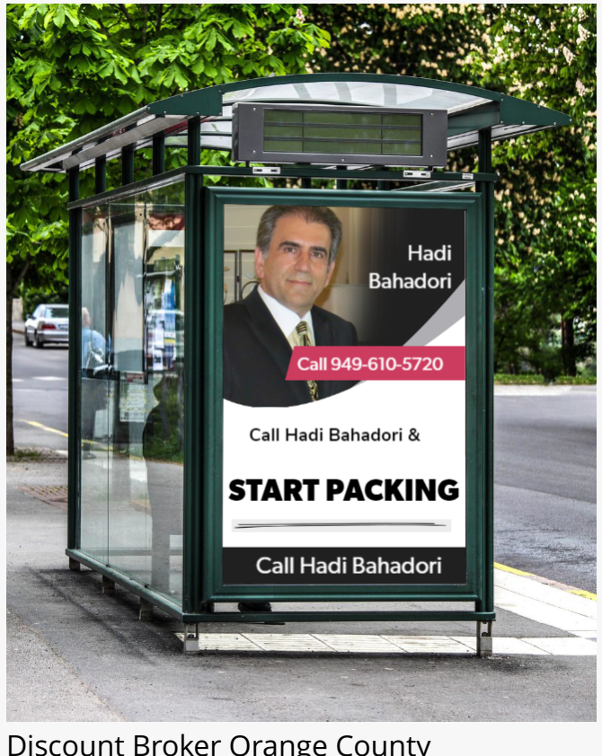
Discount Broker Orange County

"I was stunned by the amount of effort these professionals were offering to stop the