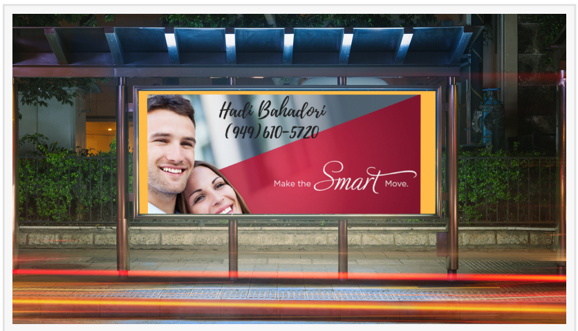
Short sale realtors in Orange County

"The process of foreclosure usually begins with the lender filing a lawsuit against homeowner. This action gives