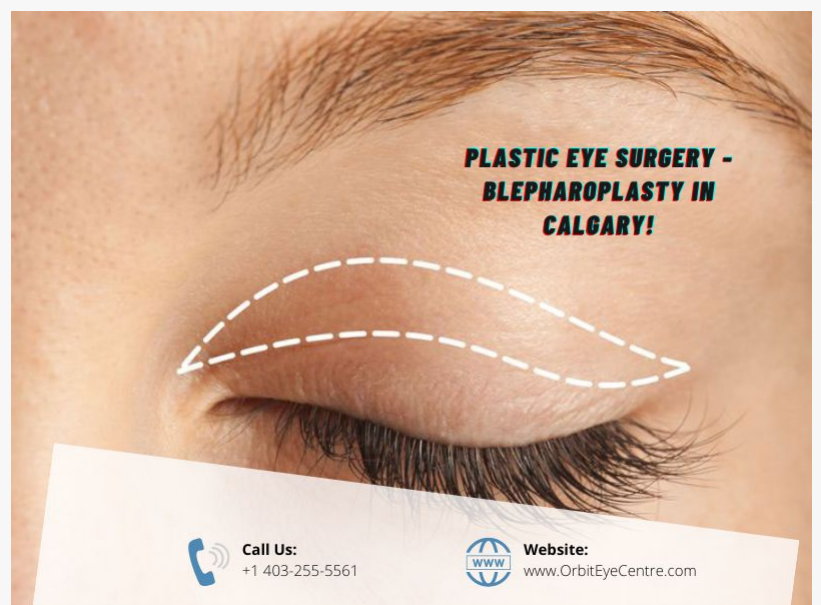
Plastic Eye Surgery - Blepharoplasty in Calgary!