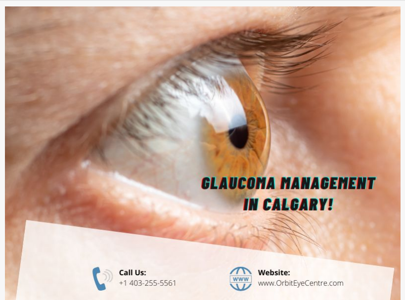
Glaucoma Management In Calgary!