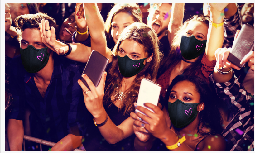
Introducing Unicorn Breathing Mask's ASTM F3502 Swiftie Edition Face Mask for Taylor Swift fans, stay safe and stylish!

Unicorn Breathing Mask's replaceable nanofiber filters have superior USA labtested breathability (a low 5.9mm h20, as opposed to N95's approx 35mm h20 rating, more than double the