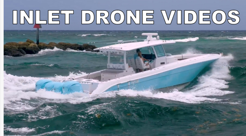
INLET DRONE VIDEOS

To learn more, email INFO@AmericasBoatingChannel.com.