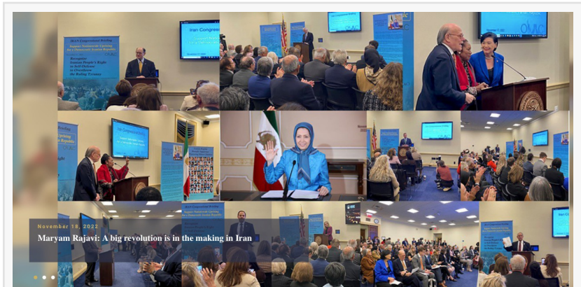
Iranian Americans, bipartisan members of congress support unfolding Iran Revolution

In his remarks, Congressman Joe Wilson (R-SC) said, "I want to commend you. The display that you have on the Capitol grounds. The American people need to see that. And so I'm just so hopeful that there's proper coverage of that in every way."