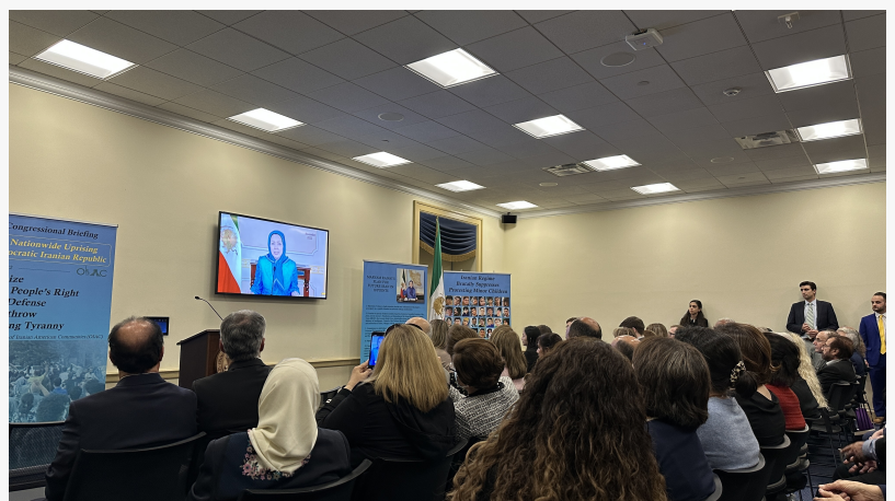
Bipartisan Members of Congress, Iranian Resistance Leader Maryam Rajavi Address OIAC Congressional Briefing, 11/17/2022

WASHINGTON, DISTRICT OF COLUMBIA, UNITED STATES, November 19, 2022 /EINPresswire.com/ -- Organization of Iranian American Communities (OIAC) held a Briefing in the U.S. House of Representatives during which bipartisan members of Congress , former Iran political prisoners, representative of OIAC youth chapter, and women's rights activists expressed unequivocal support for the unfolding revolution for democratic republic in Iran.