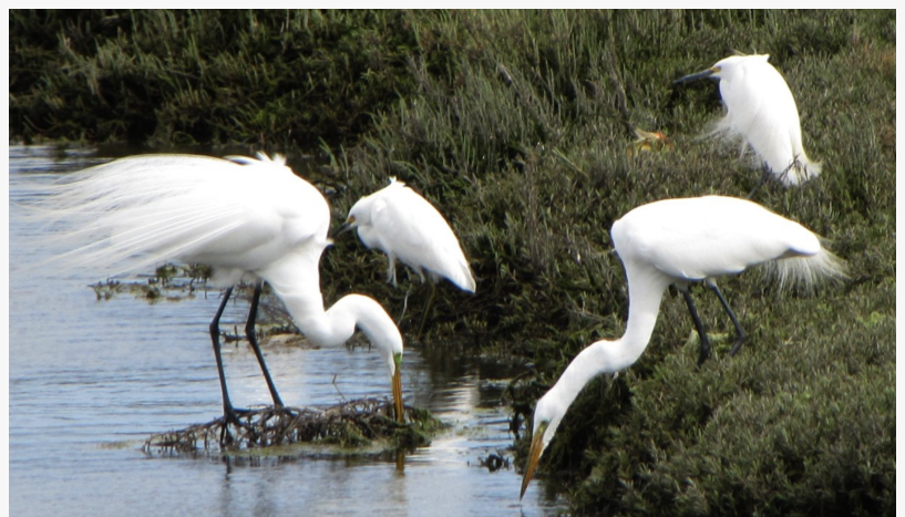
Egrets enjoying life at Ballona Wetlands, unaware there is a plan to destroy their home