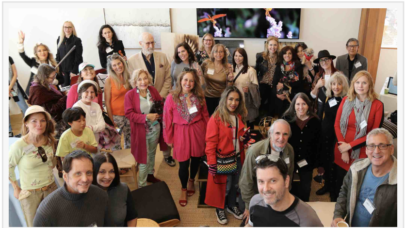
The Fundraiser to defend LA's Ballona Wetlands is packed