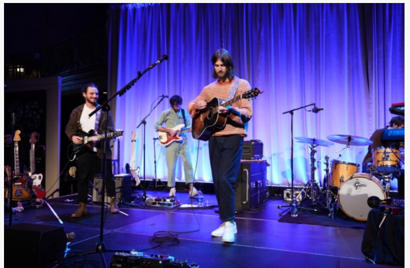
Mt. Joy.