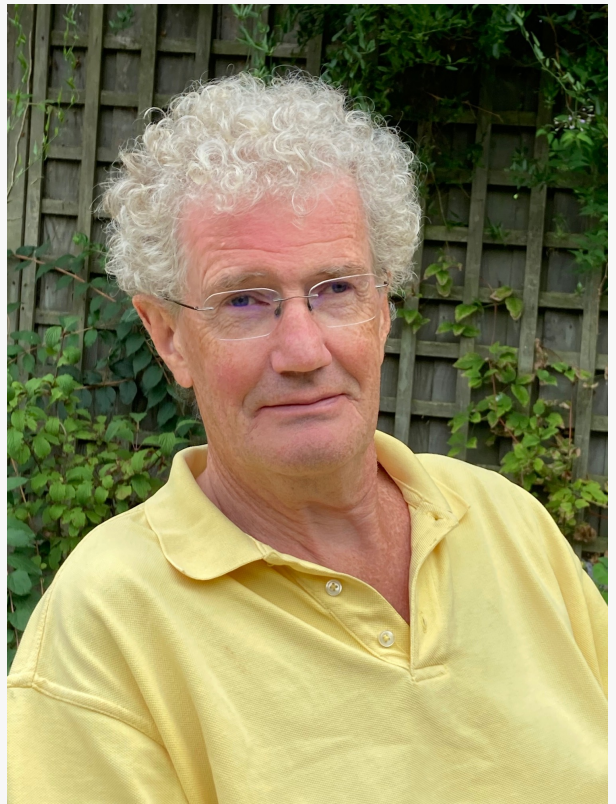
Author Nick Watts

ISBNs 978-1-908291-94-3 (Hardback) and 978-1-908291-89-9 (Paperback). It is also available as a Kindle edition. If you would like a review copy please email info@chiselbury.co.uk .