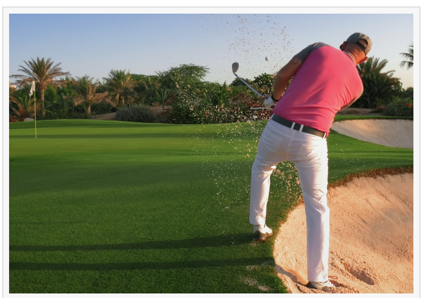
British Amateur, Eugene — His Quest to Break 80 on the Course

This press release can be viewed online at: https://www.einpresswire.com/article/602422056