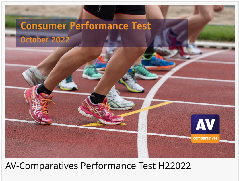
AV-Comparatives Performance Test H22022

EINPresswire.com/ -- As part of its ongoing Consumer Main-Test Series, AV-Comparatives has released the results of the October 2022 Performance Test for consumer security solutions. 17 popular anti-malware programs were evaluated to assess their speed impact.