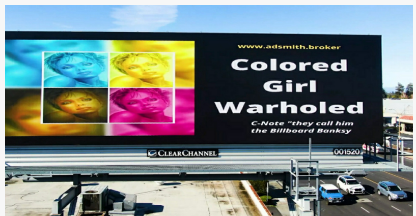
Artist's Billboard, "Look Up!" 2 Hope and Beauty