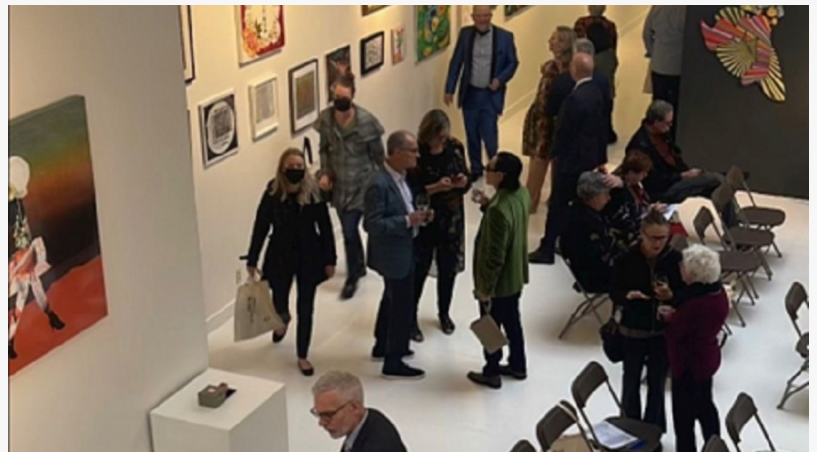
Guess Who Showed Up for the Silicon Valley Charity Art Auction