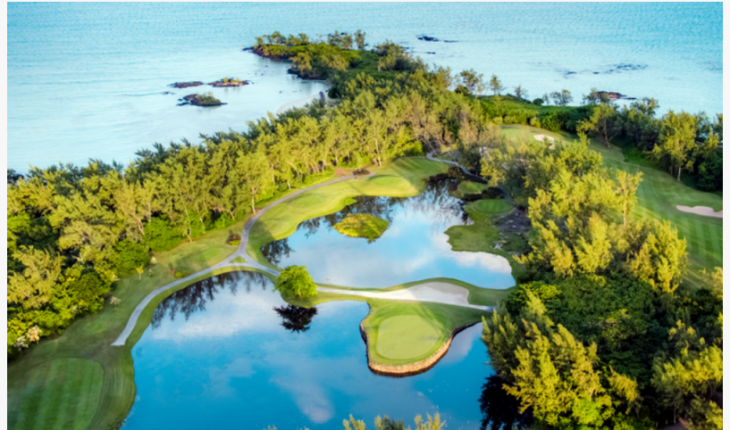
Ile aux Cerfs, Mauritius

All destinations, courses, and hotels are carefully selected, and we will of course take care of all