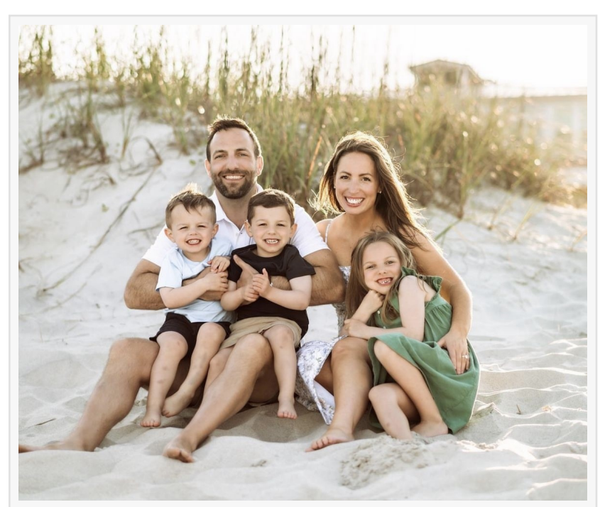
The Salamon family, Sea Love's newest franchisees.

Franchisee-hopefuls are invited to visit the Sea Love franchise page to learn more about the candle bar and boutique franchise.