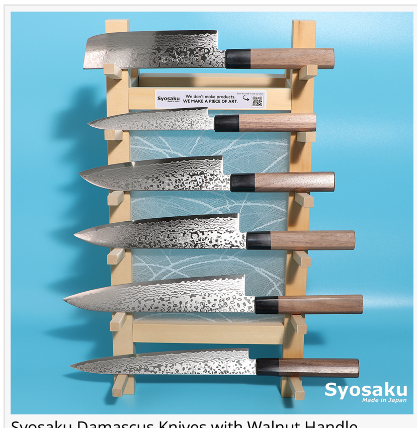
Syosaku Damascus Knives with Walnut Handle

This press release can be viewed online at: https://www.einpresswire.com/article/602625981