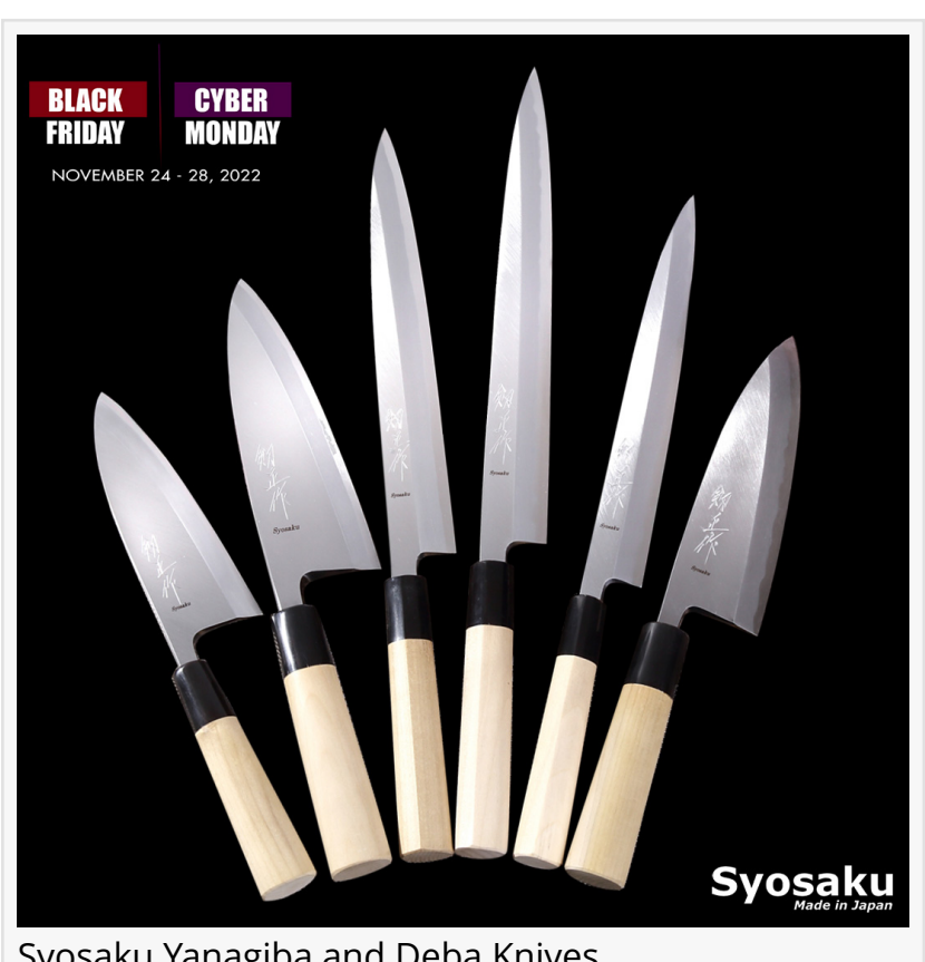
Syosaku Yanagiba and Deba Knives

For the 2022 Black Friday - Cyber Monday, they've been eyeing to give their customers the privilege to dive into a sea of savings while shopping for the holidays.