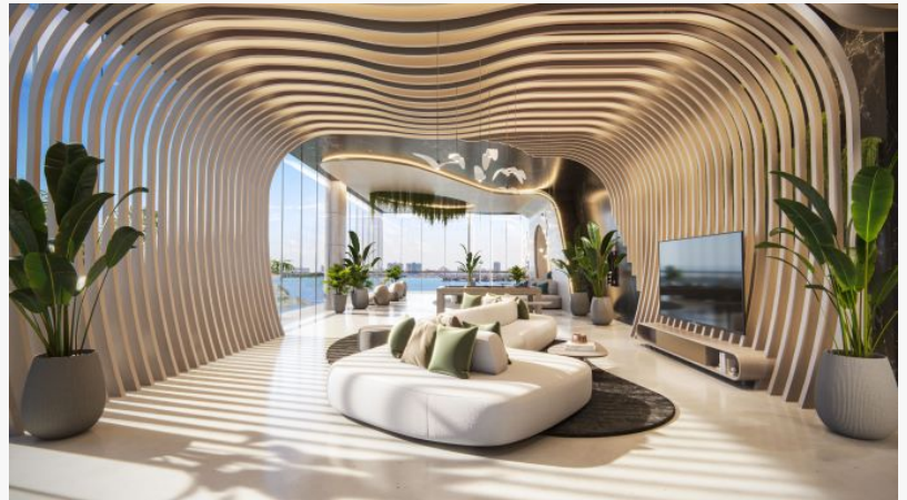
Aria Reserve Sky Lounge

The development will offer impeccably finished units with one-to-four-bedroom floor plans measuring between 1,100 and 2,600 square feet in size. Furthermore, Aria Reserve will offer a limited collection of penthouse residences, ranging from 3,500 to over 9,000 square feet. Each penthouse comes with its own one-of-a-kind personal three car garage vault.