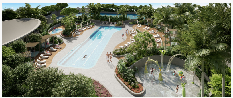
Aria Reserve Amenities

development site in Edgewater. The group has gathered an all start team to carry out this project, which has an internationally acclaimed architect; Bernardo Fort-Brescia of Arquitectonica with interiors by MORADA Haute Furniture Boutique, and lush landscaping by ArquitectonicaGEO.