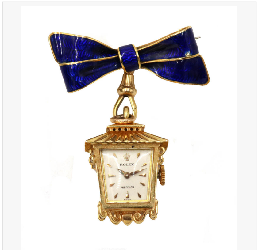
Rolex 18kt gold lantern charm manual watch, circa 1950s-1960s, together with an 18kt and blue enamel bow form pin with clasp (est. $4,000-6,000).

John Nye Nye & Company Auctioneers +1 973-984-6900 email us here