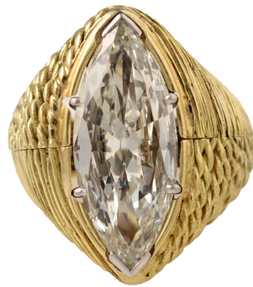
Dazzling 6.1-carat Marquis platinum and diamond engagement ring with removeable gold cocktail jacket in a ribbed basket weave pattern (est. $50,000-$70,000).

A family that spends more time in Ibiza, Spain than their home in New York consigned some equally exotic jewelry, such as a Rolex 18kt gold lantern charm watch, a rare survivor, as this type of watch was frequently damaged during use; as well as accessories like cuff links, watches,