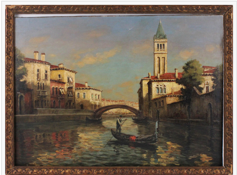
Bouvard, Oil on Canvas, Venetian canal scene, French, 19th century (est. $2,000-$4,000).

Additionally, there is a wide variety of affordable objets d'art, furniture, rugs and other reasonably-estimated pieces that would be wonderful and unusual presents during the season when it's better to give than to receive and to take care of others less fortunate than ourselves.