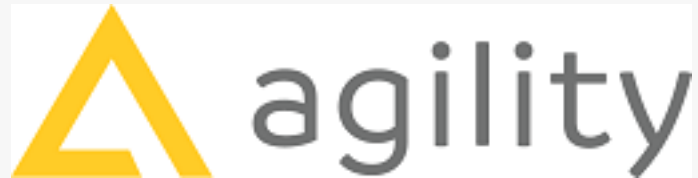
Agility CMS Logo

instant localization when an asset is posted, integrates deeper with content orchestration platforms, imports assets and large batches of content programmatically, as well as customizes content workflows and approvals.