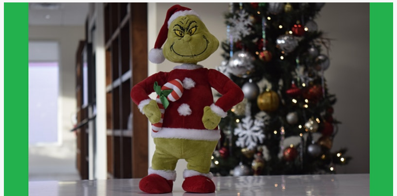
Families and kids can participate to a Scavenger Hunt in our Museum decorated as the Grinch's Hide-Out.