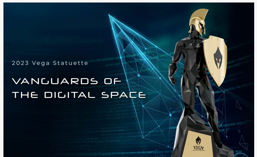
2023 Vega Digital Awards Statuette