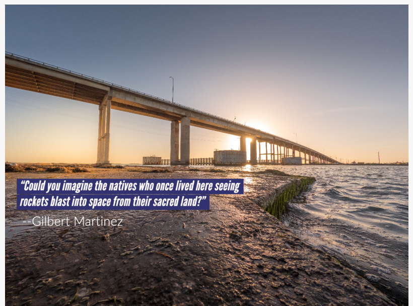
Salty Shores: The Laguna Madre is a documentary film Route Three Productions

/EINPresswire.com/ -- Corpus Christi, Texas based Route Three Productions announced on Wednesday that they are finishing production on a documentary project about the Laguna Madre and its struggle to adapt as humans require more and more space--both here on the ground and in the cosmos. The company launched a Kickstarter campaign to help fund the remaining costs associated with completing the project that they hope will be seen in film festivals across the country and around the world.