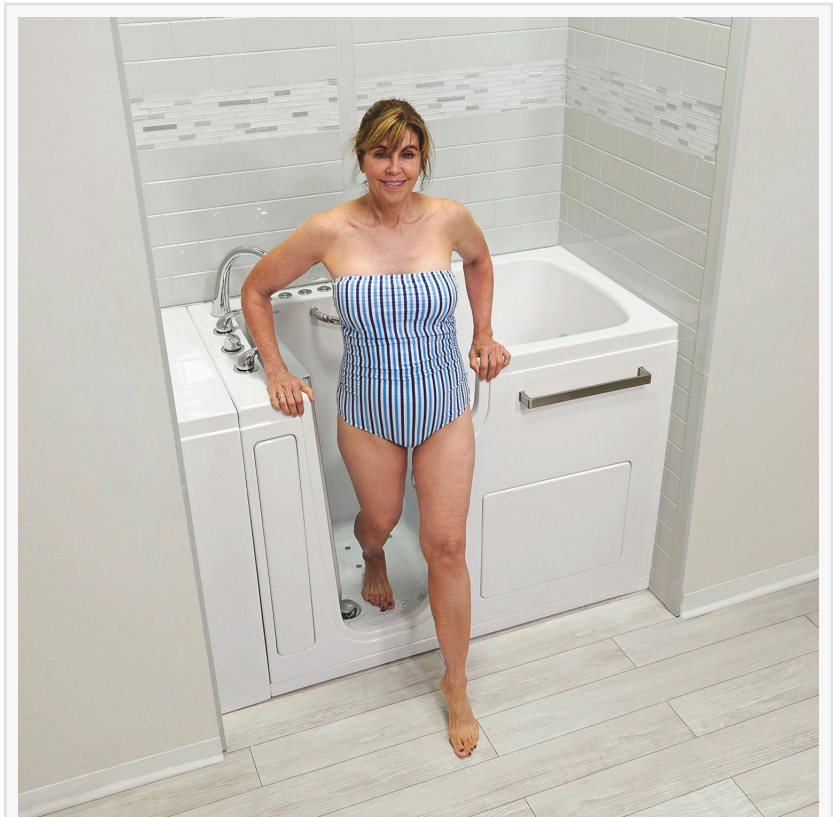
Ultra Walk-in Bathtub