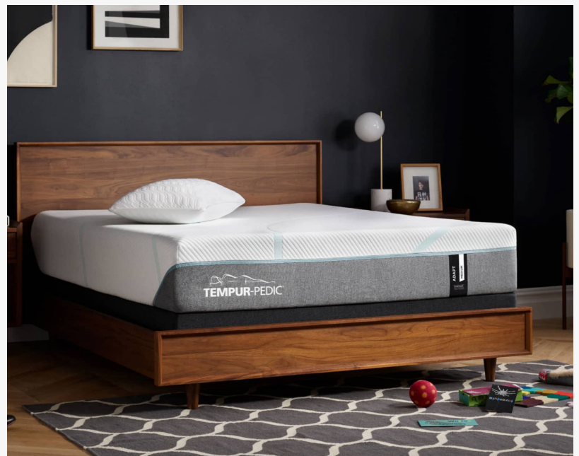
All new 2023 Tempur-Pedic Adapt & Tempur-Breeze now on display