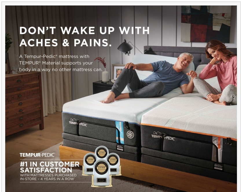
Tempur-Pedic Split King bed provides customized elevation for each partner