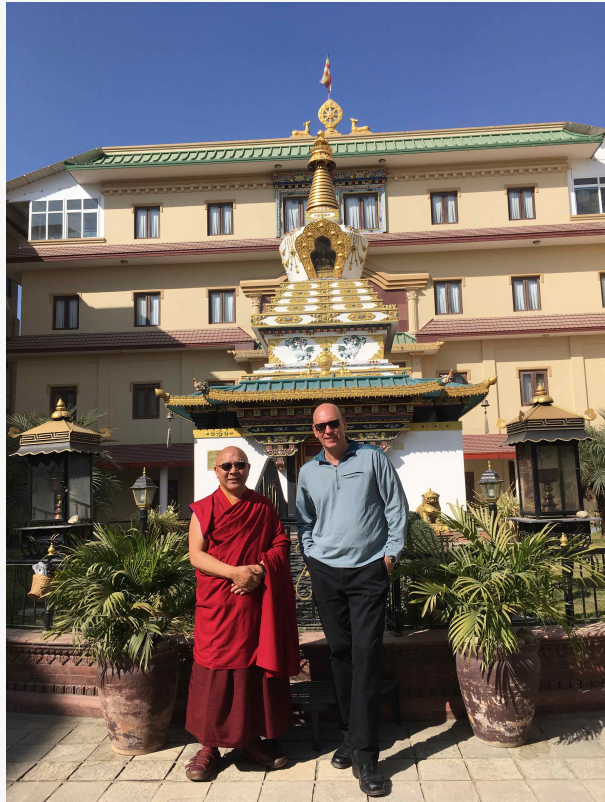
The Director Traveled to Many Countries to Interview Experts About "Happiness"