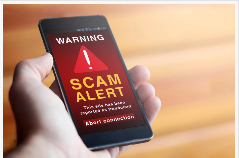
ParentShield Network urges vigilance to parents after giving a first phone

DERBY, DERBYSHIRE, UK, November 24, 2022 /EINPresswire.com/ -- Over the last 12 months, ParentShield reports it has intercepted and blocked twice as many text scam attempts as the previous 12 months, and is issuing a warning to parents who may be considering a first mobile phone for their children this Christmas.