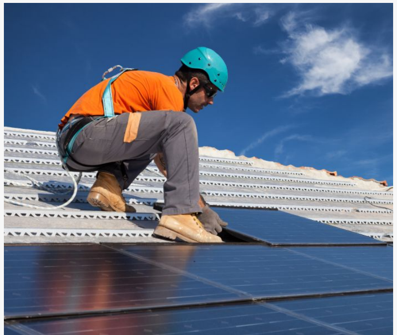
solar installation for a NJ homeowner