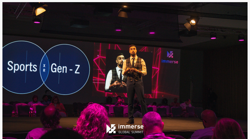
Immersive tech leaders at Immerse Global Summit

Miami, FL December 5-7, 2022, covering topics including XR, Metaverse, virtual reality, augmented reality, blockchain, 5G, cloud technologies and other immersive technologies that are impacting every sector of business, media and entertainment.