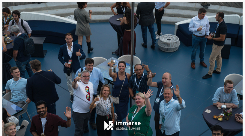
Immerse Global Summit networking session among global tech leaders