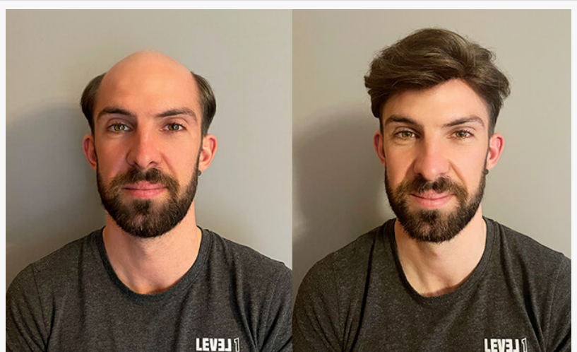
Lordhair Holds Their Biggest Black Friday Sale

Consumers trust Lordhair, which has been a supplier for many hair loss sufferers for over 15 years. Providing men's toupees direct from the factory to the consumers door, many men value the quality of Lordhair's men's toupees for the advantageous price tag. In comparison to conventional salons, Lordhair offers the opportunity to get amazing hair for up to a quarter of the price. With the Lordhair Black Friday sales 2022, even more savings can be gained.