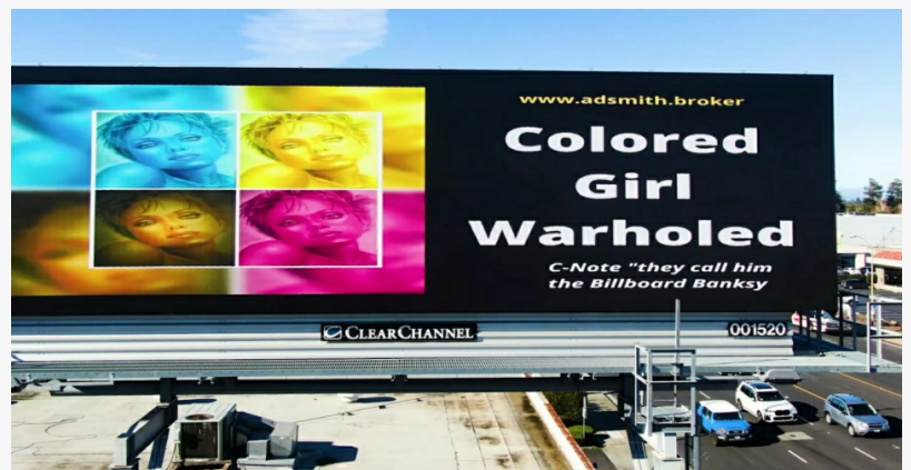
"LOOK UP!" 2, HOPE & BEAUTY, a billboard art exhibition featuring "Color Girl Warholed," an artwork by C-Note.