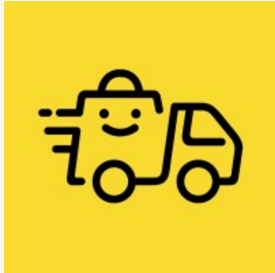
Hassle free shopping experience

From our research it is found that standing in a queue for trial rooms and on till is hard to hold and manage those bags especially when you are with a child. Let's not forget how unsafe it is to roam around with those bags being scared & worried to get attacked by robbers. The constant increase in the carbon footprint across the globe has been also considered and that is why