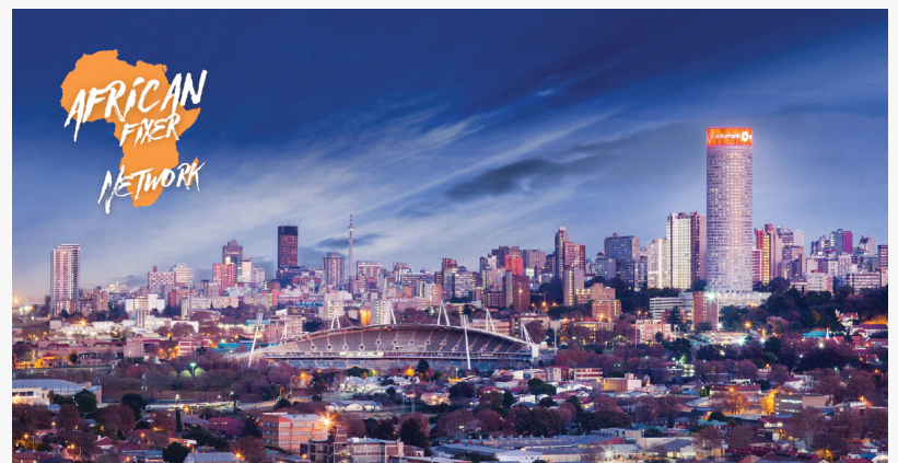
Johannesburg City, South Africa