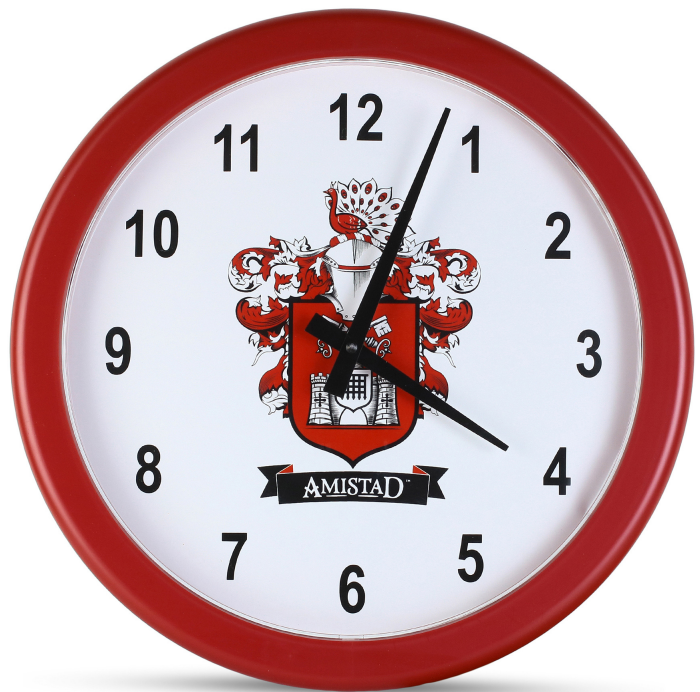
Product Photography For Shopify Website

Elaborating on her professional product photography services, she explains that it's essential