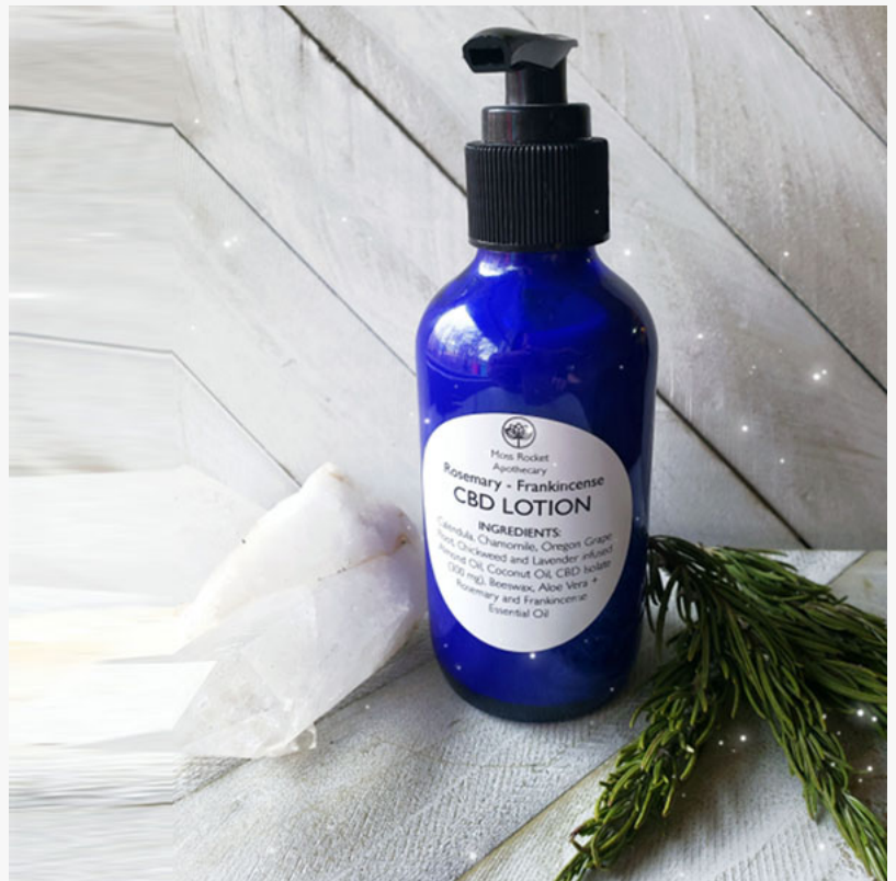
CBD Body Lotion