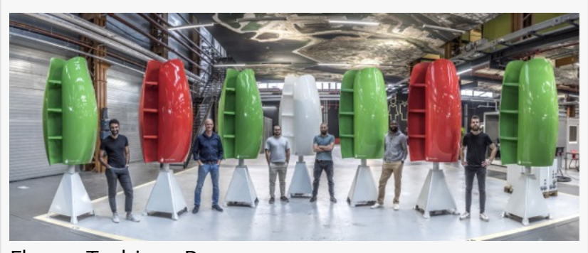
Flower Turbines Panorama

Investors who register for Online Demo Week will receive access to all participating startups through Newchip's Investor Relations team and can watch the whole week for free. If you are unable to watch the event live, make sure to register anyway to receive access to all pitches, including ours, on-demand after the event.