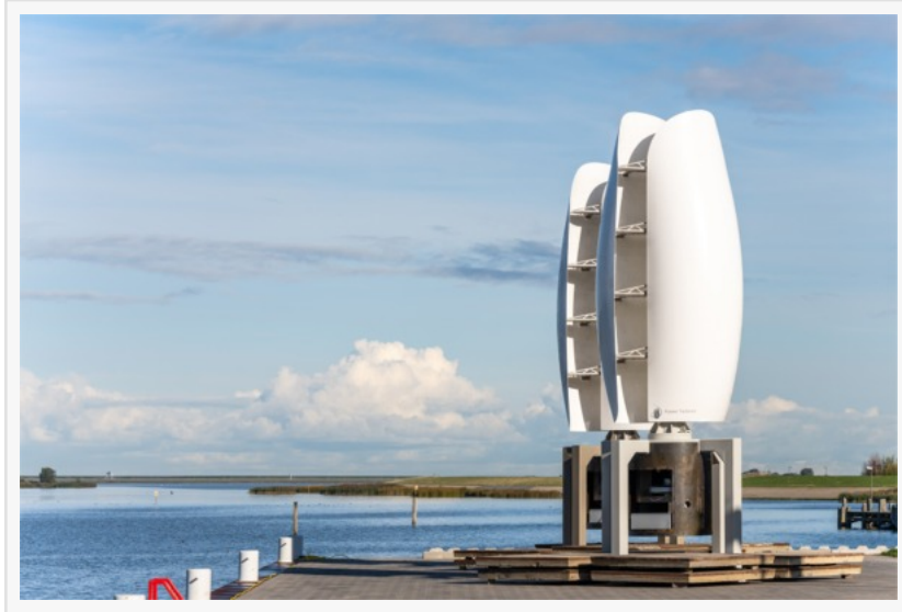
Large Size Flower Turbines at a Shipyard

Flower Turbines has external validation as a top company: