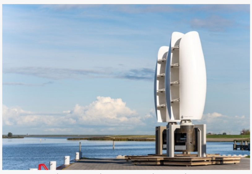
Large Size Flower Turbines at a Shipyard