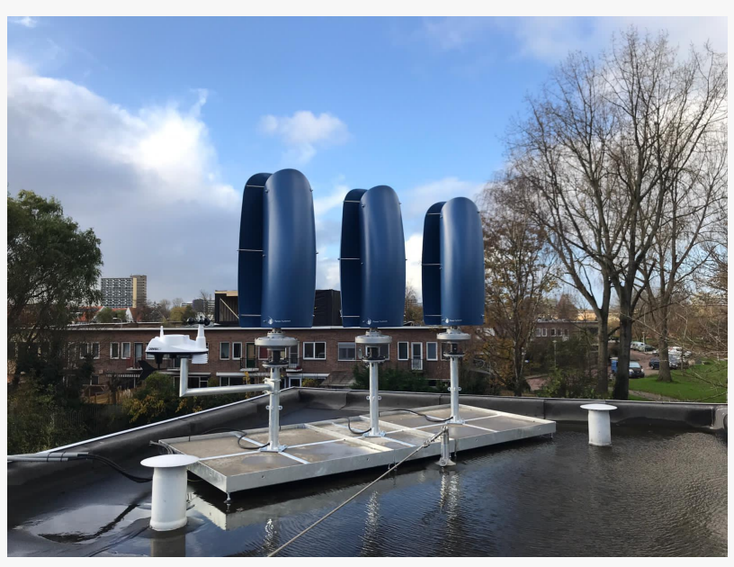
Three installed small size Wind Tulips

And you can buy or reserve products at <a href="https://flowerturbines.com/store/">https://flowerturbines.com/store/</a>. If you are in the EU, you can buy by quotation with our staff at support.eu@flowerturbines.com Outside of that,