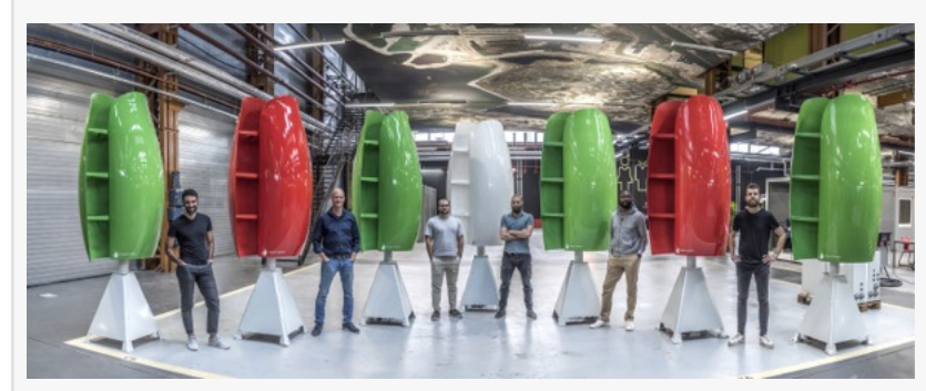
Flower Turbines Panorama