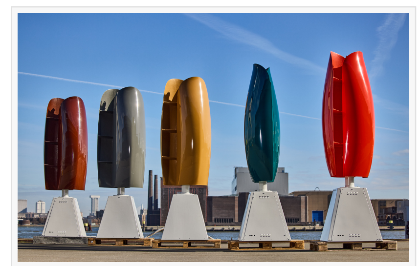
Bouquet of Wind Tulip Turbines

manage.com/subscribe/post?u=1df9d1eb5d9f948bcbf119034&id=966da9c23e