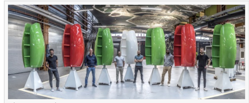
Flower Turbines Panorama

manage.com/subscribe/post?u=1df9d1eb5d9f948bcbf119034&id=966da9c23e