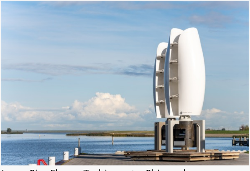
Large Size Flower Turbines at a Shipyard