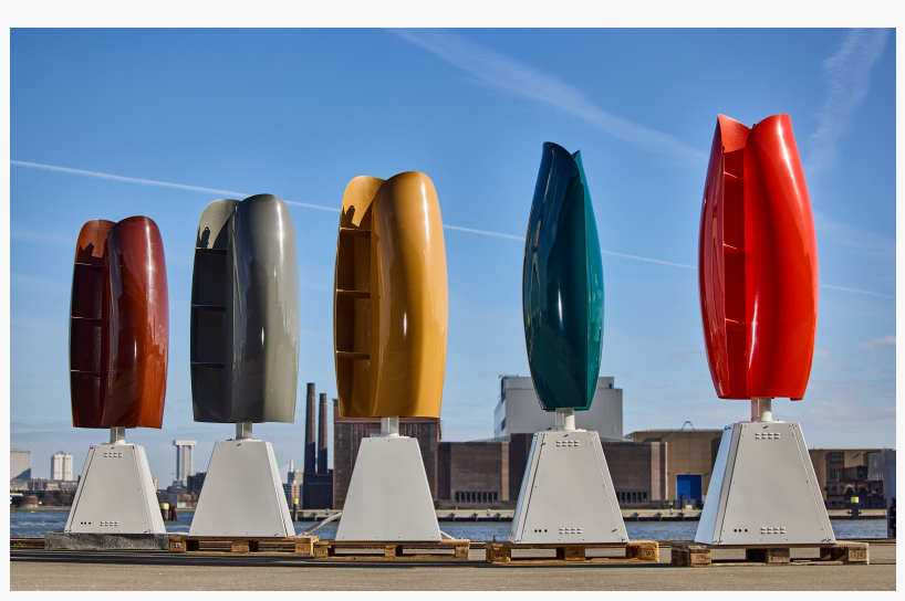
Bouquet of Wind Tulip Turbines

And you can buy or reserve products at <a href="https://flowerturbines.com/store/">https://flowerturbines.com/store/</a>. If you are in the EU, you can buy by quotation with our staff at support.eu@flowerturbines.com Outside of that,