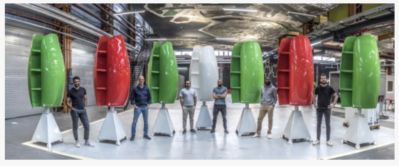
Flower Turbines Panorama