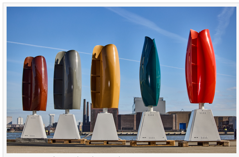
Bouquet of Wind Tulip Turbines

-Flower Turbines has been awarded the "Solar Impulse Efficient Solution" Label, a proof of high standards in