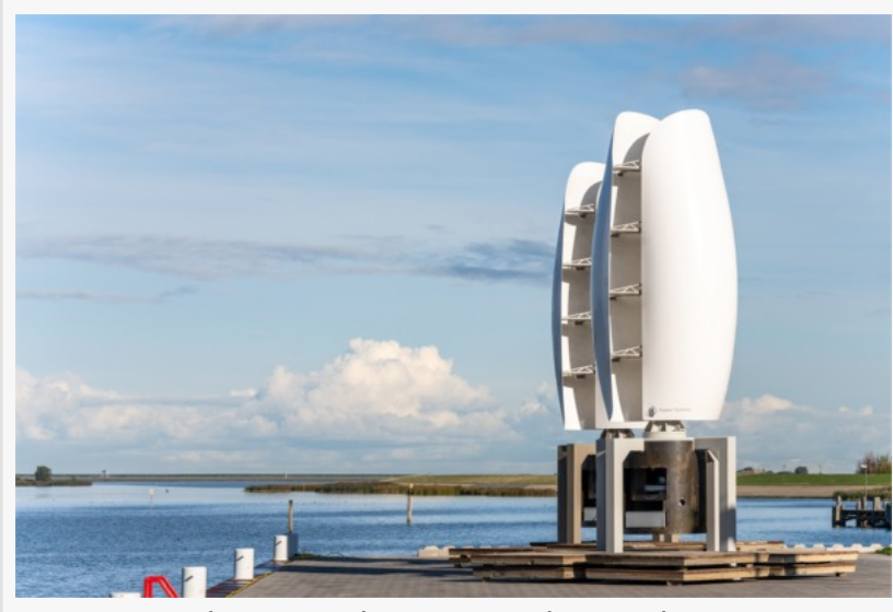
Large Size Flower Turbines at a Shipyard