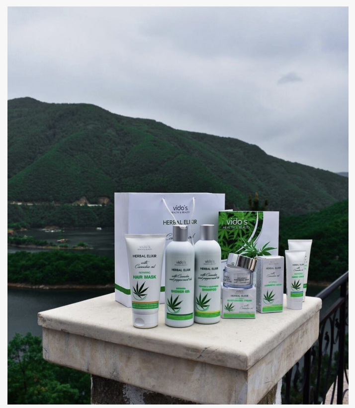
Herbal Skincare Elixirs from Vido's Health & Beauty USA

Vido's Health & Beauty USA is bringing Europeanquality, herbal skincare elixirs that use Hemp Seed Oil, vitamins, and other natural essential oils to the U.S.