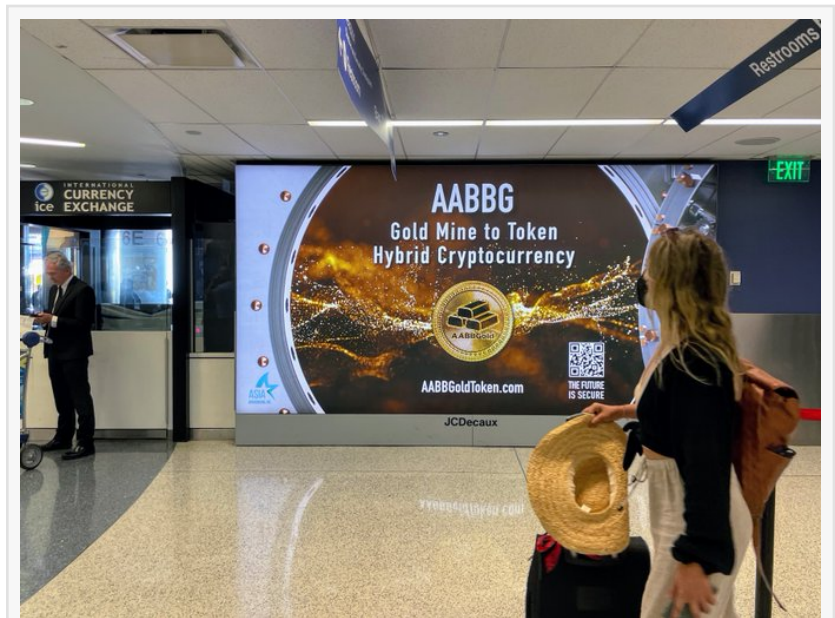
AABB Stock Symbol

In addition to the growth of its mining business segment, AABB is currently broadening its digital asset division with significant additions and enhancements to improve product functionality, efficiency, and feasibility. These upgrade, expansion, and development events are expected to be rolled out and announced as they become available shortly.