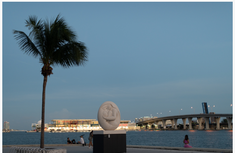
Jorge Jiménez Deredia, "El Alquimista," Marble Sculpture