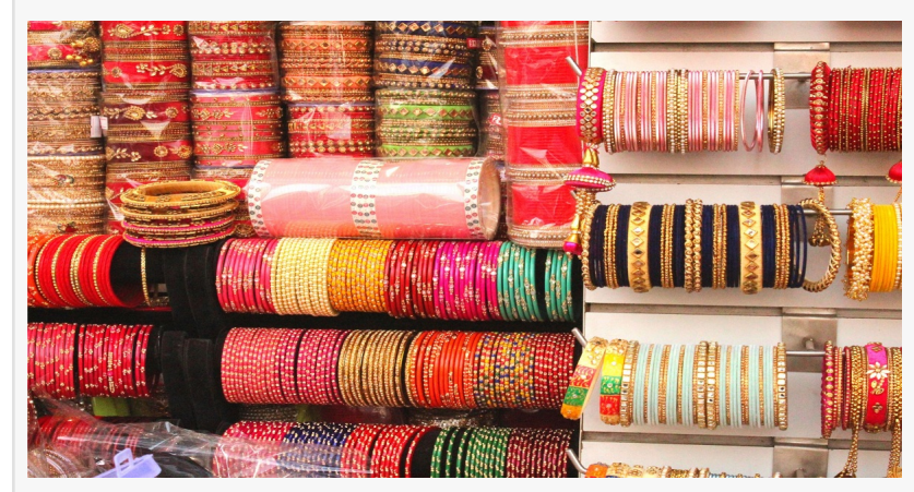
Bangles in Delhi