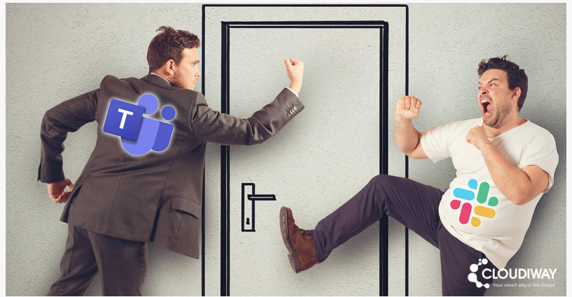
Slack Vs Teams

/EINPresswire.com/ -- Despite the "return to work" movement, Slack and Microsoft Teams are still booming, and both apps allow us to operate from home effectively to communicate with one another through text messages, voice calls, and video conferences.