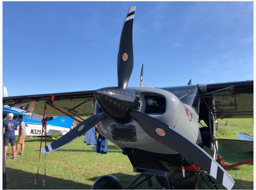
Hartzell Pathfinder Backcountry Propeller

EINPresswire.com/ -- Hartzell Propeller will extend its $1,000 discount to supporters of the Recreational Aviation Foundation (RAF) on all new Hartzell backcountry airplane propellers, now through 2023, marking the third consecutive year of this discount. In addition to these savings, Hartzell is making a $250 contribution to the RAF mission for each of these special sales.